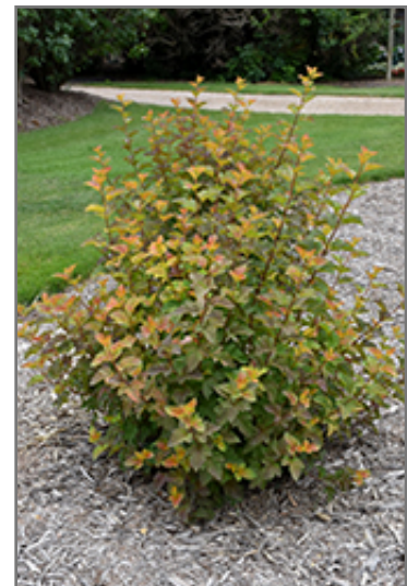
Amber Jubilee Ninebark