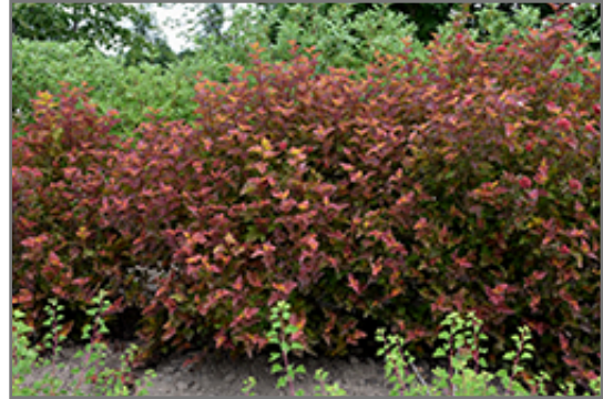
Amber Jubilee Ninebark

This shrub does best in full sun to partial shade. It is very adaptable to both dry and moist locations, and should do just fine under average home landscape conditions. It is not particular as to soil type or pH. It is highly tolerant of urban pollution and will even thrive in inner city environments. This is a selection of a native North American species.