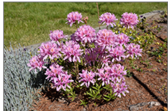
Orchid Lights Azalea in bloom