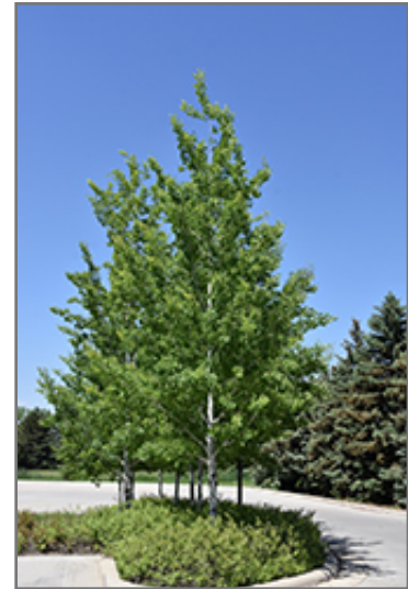
Prairie Gold® Aspen