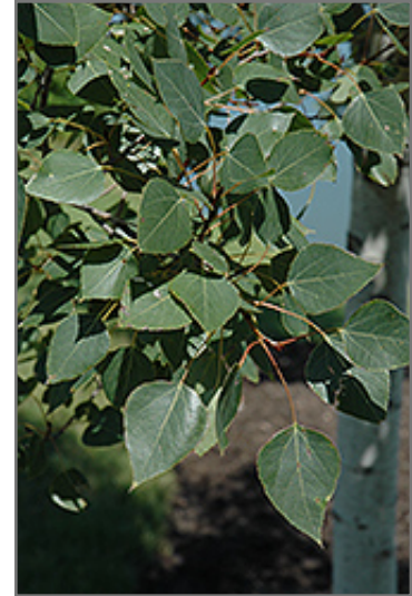
Prairie Gold® Aspen foliage

This tree should only be grown in full sunlight. It is an amazingly adaptable plant, tolerating both dry conditions and even some standing water. It is considered to be drought-tolerant, and thus makes an ideal choice for xeriscaping or the moisture-conserving landscape. It is not particular as to soil type or pH. It is somewhat tolerant of urban pollution. This is a selection of a native North American species.