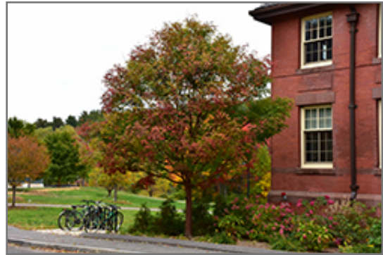
Gingerbread Paperbark Maple in fall