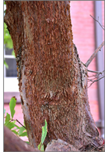
Gingerbread Paperbark Maple bark

This tree does best in full sun to partial shade. It prefers to grow in average to moist conditions, and shouldn't be allowed to dry out. It is not particular as to soil type or pH. It is somewhat tolerant of urban pollution. This particular variety is an interspecific hybrid.