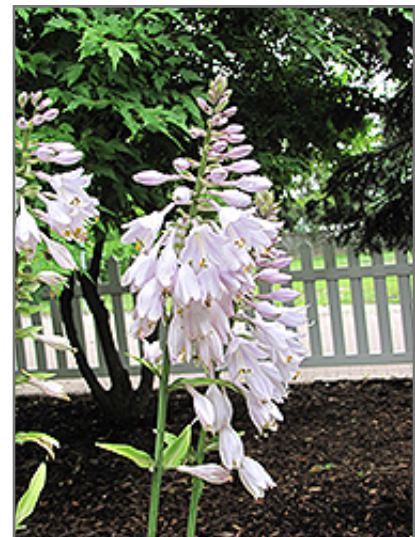
Key West Hosta flowers