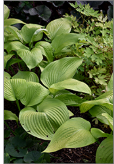
Key West Hosta

This plant does best in partial shade to shade. It prefers to grow in average to moist conditions, and shouldn't be allowed to dry out. It is not particular as to soil type or pH. It is somewhat tolerant of urban pollution. This particular variety is an interspecific hybrid. It can be propagated by division; however, as a cultivated variety, be aware that it may be subject to certain restrictions or prohibitions on propagation.