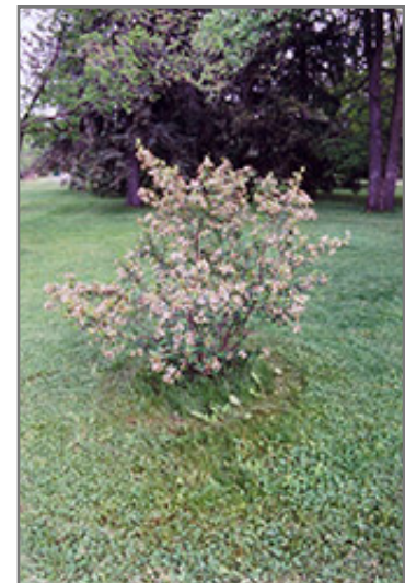
Black Chokeberry in bloom