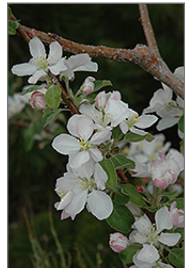
Pink Lady Apple flowers