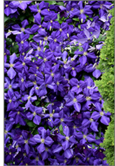
Jackmanii Clematis in bloom