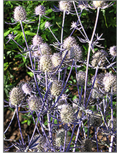
Jade Frost Variegated Sea Holly flowers

Jade Frost Variegated Sea Holly is a fine choice for the garden, but it is also a good selection for planting in outdoor pots and containers. It can be used either as 'filler' or as a 'thriller' in the 'spiller-thriller-filler' container combination, depending on the height and form of the other plants used in the container planting. Note that when growing plants in outdoor containers and baskets, they may require more frequent waterings than they would in the yard or garden.