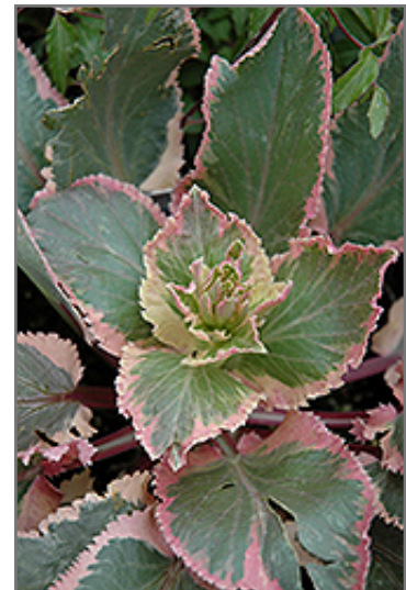
Jade Frost Variegated Sea Holly foliage