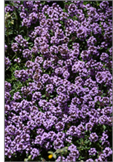
Pink Chintz Creeping Thyme flowers