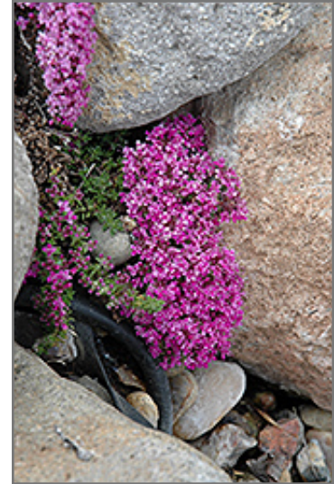
Pink Chintz Creeping Thyme in bloom

This plant should only be grown in full sunlight. It prefers to grow in average to dry locations, and dislikes excessive moisture. It is considered to be drought-tolerant, and thus makes an ideal choice for a low-water garden or xeriscape application. It is not particular as to soil type or pH. It is highly tolerant of urban pollution and will even thrive in inner city environments. Consider covering it with a thick layer of mulch in winter to protect it in exposed locations or colder microclimates. This is a selected variety of a species not originally from North America. It can be propagated by division; however, as a cultivated variety, be aware that it may be subject to certain restrictions or prohibitions on propagation.