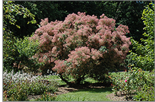
Grace Smokebush in bloom

This shrub will require occasional maintenance and upkeep, and is best pruned in late winter once the threat of extreme cold has passed. Deer don't particularly care for this plant and will usually leave it alone in favor of tastier treats. It has no significant negative characteristics.