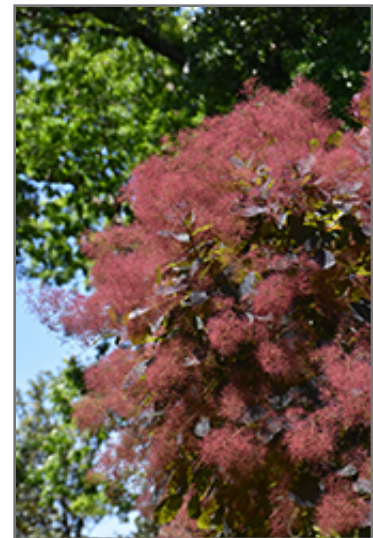
Grace Smokebush flowers