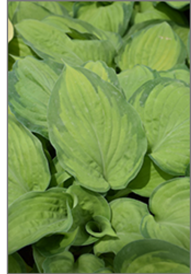
Paradigm Hosta foliage

This plant does best in partial shade to shade. It prefers to grow in average to moist conditions, and shouldn't be allowed to dry out. It is not particular as to soil type or pH. It is somewhat tolerant of urban pollution. This particular variety is an interspecific hybrid. It can be propagated by division; however, as a cultivated variety, be aware that it may be subject to certain restrictions or prohibitions on propagation.