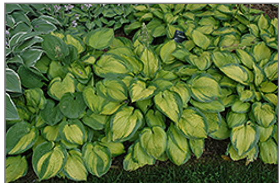
Paradigm Hosta