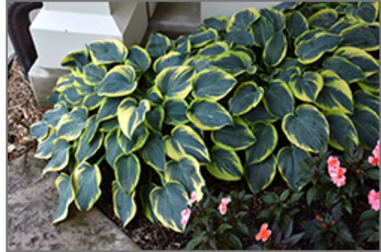
First Frost Hosta

This plant does best in partial shade to shade. It prefers to grow in average to moist conditions, and shouldn't be allowed to dry out. It is not particular as to soil type or pH. It is somewhat tolerant of urban pollution. This particular variety is an interspecific hybrid. It can be propagated by division; however, as a cultivated variety, be aware that it may be subject to certain restrictions or prohibitions on propagation.