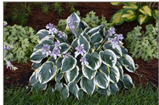
First Frost Hosta in bloom