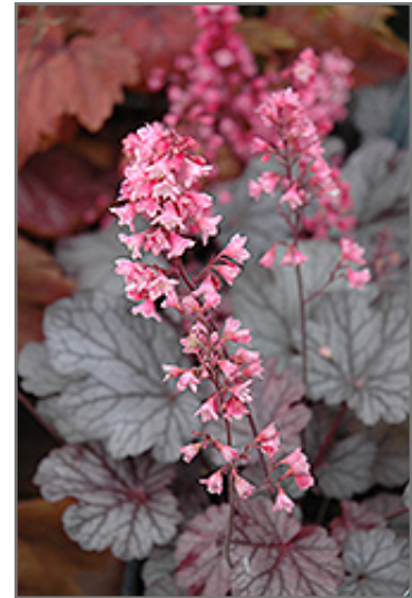
Milan Coral Bells flowers

Milan Coral Bells is recommended for the following landscape applications;