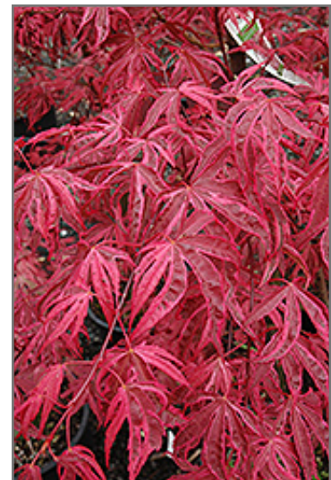
Shirazz Japanese Maple foliage