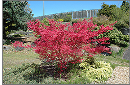
Shindeshojo Japanese Maple in spring

This tree does best in full sun to partial shade. You may want to keep it away from hot, dry locations that receive direct afternoon sun or which get reflected sunlight, such as against the south side of a white wall. It prefers to grow in average to moist conditions, and shouldn't be allowed to dry out. It is not particular as to soil pH, but grows best in rich soils. It is somewhat tolerant of urban pollution, and will benefit from being planted in a relatively sheltered location. Consider applying a thick mulch around the root zone in winter to protect it in exposed locations or colder microclimates. This is a selected variety of a species not originally from North America.