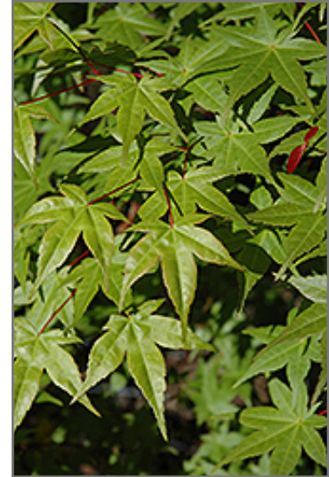
Shindeshojo Japanese Maple foliage

Shindeshojo Japanese Maple is recommended for the following landscape applications;