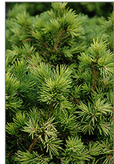
Tompa Dwarf Spruce foliage