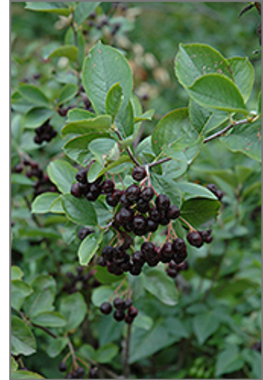
Black Chokeberry fruit