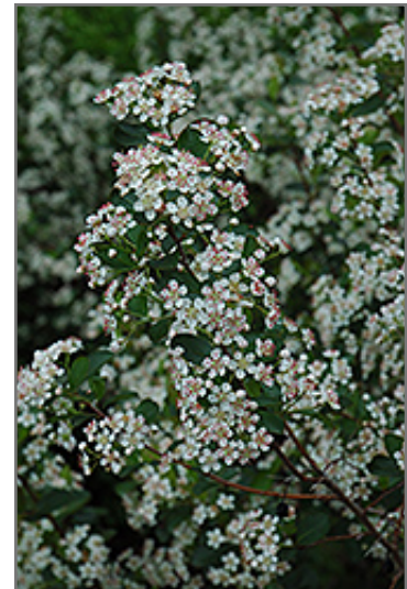
Black Chokeberry flowers