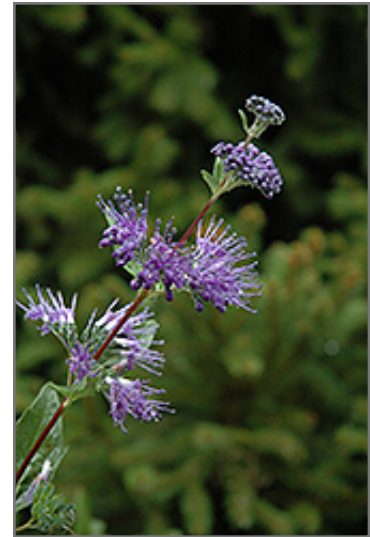
Blue Mist Caryopteris flowers

Blue Mist Caryopteris is recommended for the following landscape applications;