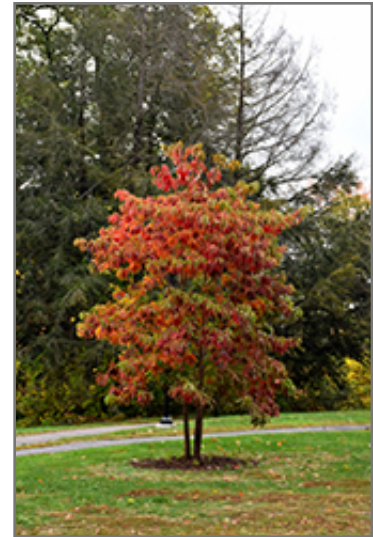
Sassafras in fall

This tree will require occasional maintenance and upkeep, and is best pruned in late winter once the threat of extreme cold has passed. It is a good choice for attracting birds to your yard, but is not particularly attractive to deer who tend to leave it alone in favor of tastier treats. Gardeners should be aware of the following characteristic(s) that may warrant special consideration;