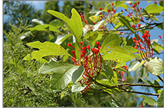
Sassafras flowers

This tree performs well in both full sun and full shade. It prefers to grow in average to moist conditions, and shouldn't be allowed to dry out. It is not particular as to soil type, but has a definite preference for acidic soils, and is subject to chlorosis (yellowing) of the foliage in alkaline soils. It is quite intolerant of urban pollution, therefore inner city or urban streetside plantings are best avoided. This species is native to parts of North America.