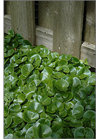
European Wild Ginger