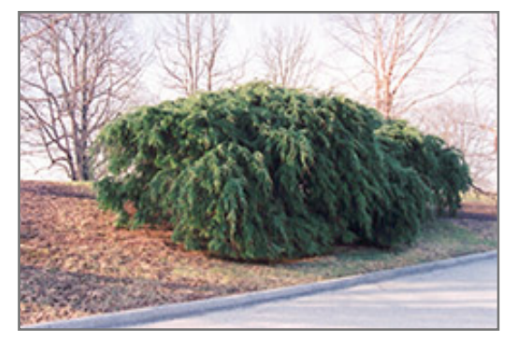
Sargent's Weeping Hemlock

This shrub will require occasional maintenance and upkeep, and is best pruned in late winter once the threat of extreme cold has passed. Gardeners should be aware of the following characteristic(s) that may warrant special consideration;