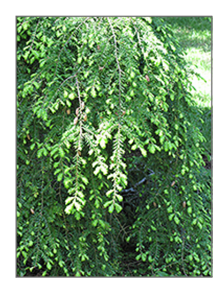
Sargent's Weeping Hemlock foliage