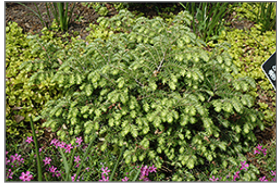
Moon Frost Hemlock

Moon Frost Hemlock is recommended for the following landscape applications;