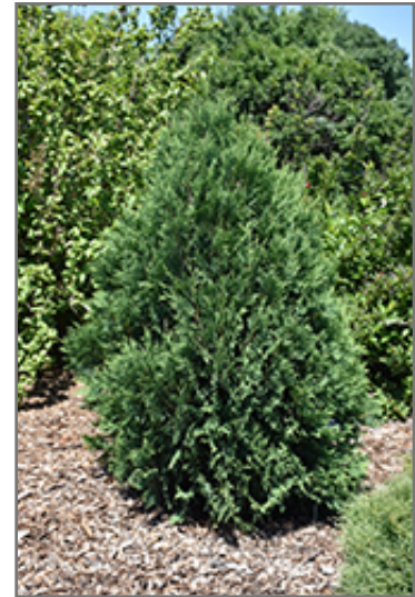
Technito Arborvitae