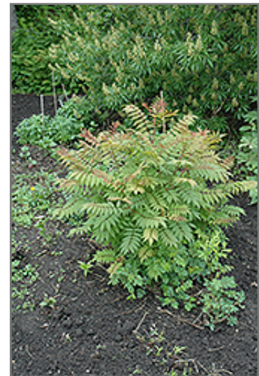
Sem False Spirea