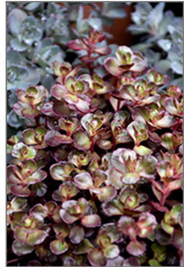
Voodoo Stonecrop foliage

Voodoo Stonecrop is recommended for the following landscape applications;