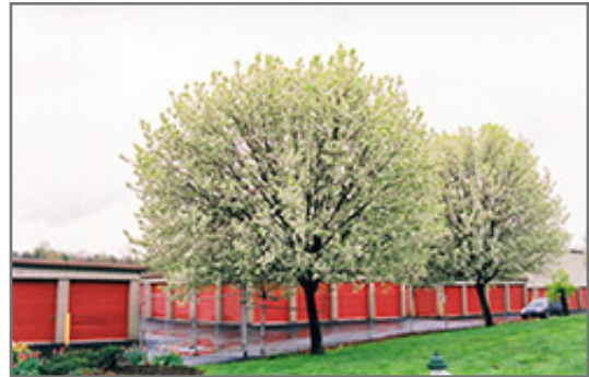
Bradford Ornamental Pear in bloom