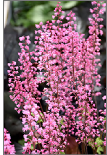
Dayglow Pink Foamy Bells flowers

Dayglow Pink Foamy Bells is a fine choice for the garden, but it is also a good selection for planting in outdoor pots and containers. It is often used as a 'filler' in the 'spiller-thriller-filler' container combination, providing a mass of flowers and foliage against which the larger thriller plants stand out. Note that when growing plants in outdoor containers and baskets, they may require more frequent waterings than they would in the yard or garden.