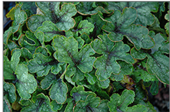
Dayglow Pink Foamy Bells foliage