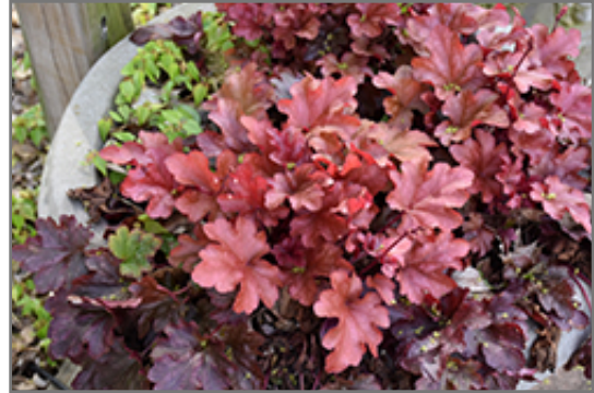
Peach Flambe Coral Bells