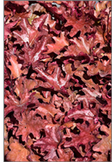
Peach Flambe Coral Bells foliage

Peach Flambe Coral Bells is a dense herbaceous evergreen perennial with tall flower stalks held atop a low mound of foliage. Its relatively fine texture sets it apart from other garden plants with less refined foliage.