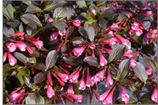
Very Fine Wine Weigela flowers

Very Fine Wine Weigela is recommended for the following landscape applications;