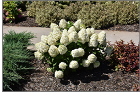
Little Lime Punch Hydrangea in bloom

Little Lime Punch Hydrangea makes a fine choice for the outdoor landscape, but it is also well-suited for use in outdoor pots and containers. With its upright habit of growth, it is best suited for use as a 'thriller' in the 'spiller-thriller-filler' container combination; plant it near the center of the pot, surrounded by smaller plants and those that spill over the edges. It is even sizeable enough that it can be grown alone in a suitable container. Note that when grown in a container, it may not perform exactly as indicated on the tag - this is to be expected. Also note that when growing plants in outdoor containers and baskets, they may require more frequent waterings than they would in the yard or garden.