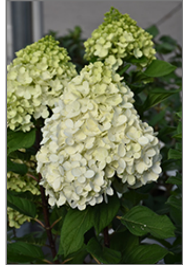
Little Lime Punch Hydrangea flowers

Little Lime Punch Hydrangea is recommended for the following landscape applications;