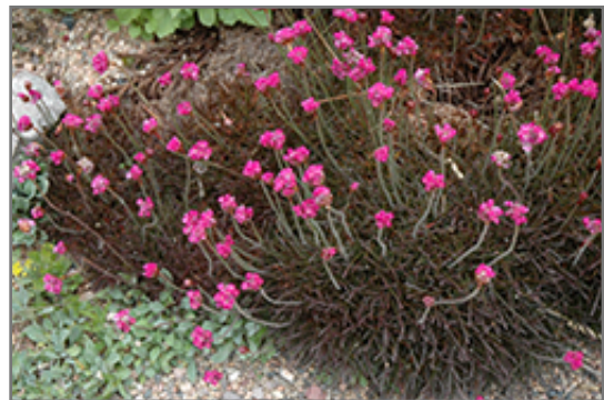
Red-leaved Sea Thrift in bloom