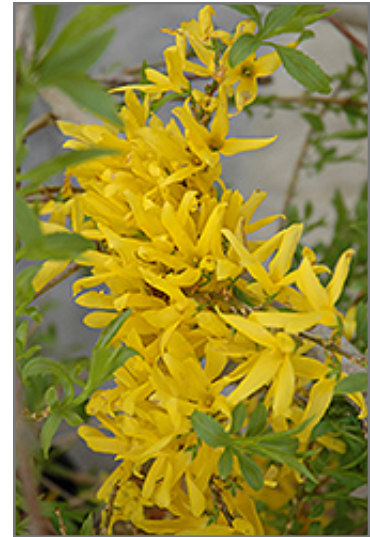
Gold Tide Forsythia flowers

Gold Tide Forsythia is recommended for the following landscape applications;