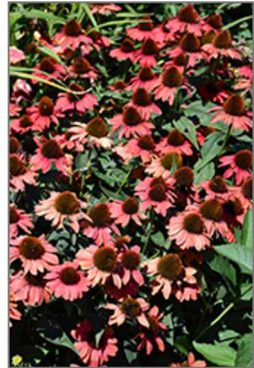
Color Coded Frankly Scarlet Coneflower flowers

Color Coded Frankly Scarlet Coneflower is an herbaceous perennial with an upright spreading habit of growth. Its medium texture blends into the garden, but can always be balanced by a couple of finer or coarser plants for an effective composition.