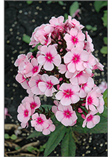
Bright Eyes Garden Phlox flowers

Bright Eyes Garden Phlox is a fine choice for the garden, but it is also a good selection for planting in outdoor pots and containers. With its upright habit of growth, it is best suited for use as a 'thriller' in the 'spiller-thriller-filler' container combination; plant it near the center of the pot, surrounded by smaller plants and those that spill over the edges. It is even sizeable enough that it can be grown alone in a suitable container. Note that when growing plants in outdoor containers and baskets, they may require more frequent waterings than they would in the yard or garden.