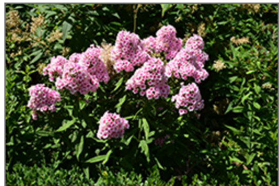
Bright Eyes Garden Phlox in bloom