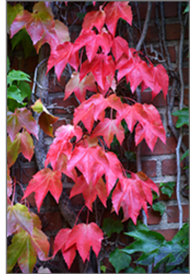
Boston Ivy in fall