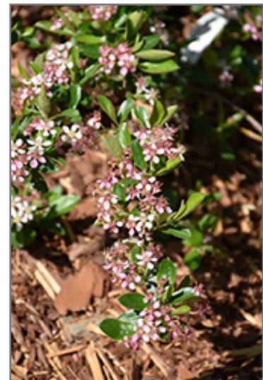
Ground Hug Aronia flowers