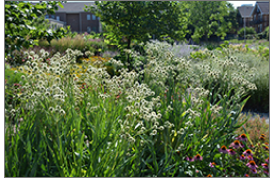
Rattlesnake Master in bloom

Rattlesnake Master is a fine choice for the garden, but it is also a good selection for planting in outdoor pots and containers. Because of its height, it is often used as a 'thriller' in the 'spiller-thriller-filler' container combination; plant it near the center of the pot, surrounded by smaller plants and those that spill over the edges. It is even sizeable enough that it can be grown alone in a suitable container. Note that when growing plants in outdoor containers and baskets, they may require more frequent waterings than they would in the yard or garden.