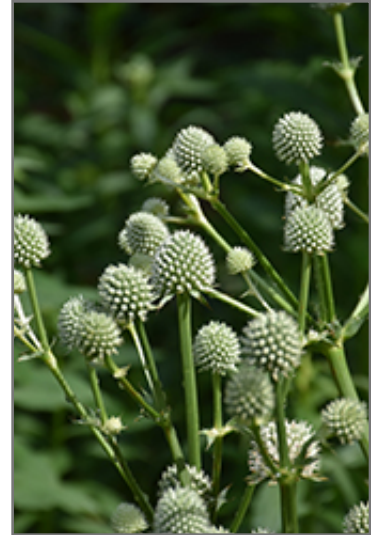
Rattlesnake Master flowers

Rattlesnake Master is an herbaceous perennial with a mounded form. Its relatively fine texture sets it apart from other garden plants with less refined foliage.