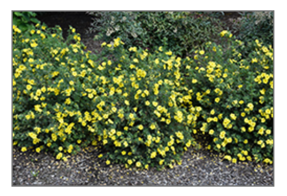
Cheesehead Potentilla in bloom

This is a relatively low maintenance shrub, and is best pruned in late winter once the threat of extreme cold has passed. It is a good choice for attracting butterflies to your yard, but is not particularly attractive to deer who tend to leave it alone in favor of tastier treats. It has no significant negative characteristics.