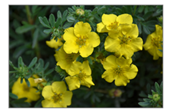
Cheesehead Potentilla flowers

Cheesehead Potentilla is a dense multi-stemmed deciduous shrub with an upright spreading habit of growth. Its relatively fine texture sets it apart from other landscape plants with less refined foliage.