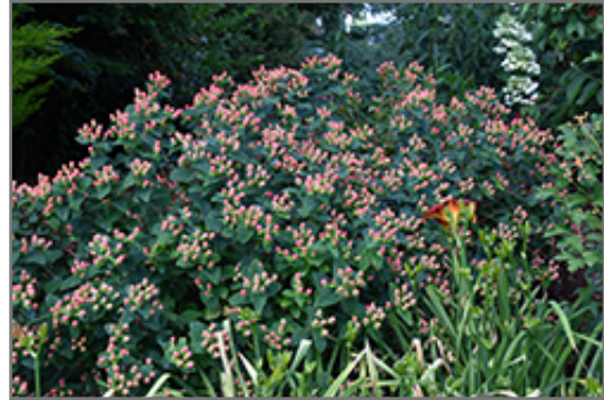
FloralBerry Rosé St. John's Wort fruit

FloralBerry Rosé St. John's Wort makes a fine choice for the outdoor landscape, but it is also well-suited for use in outdoor pots and containers. With its upright habit of growth, it is best suited for use as a 'thriller' in the 'spiller-thriller-filler' container combination; plant it near the center of the pot, surrounded by smaller plants and those that spill over the edges. It is even sizeable enough that it can be grown alone in a suitable container. Note that when grown in a container, it may not perform exactly as indicated on the tag - this is to be expected. Also note that when growing plants in outdoor containers and baskets, they may require more frequent waterings than they would in the yard or garden.