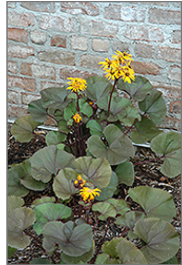
Britt Marie Crawford Rayflower in bloom