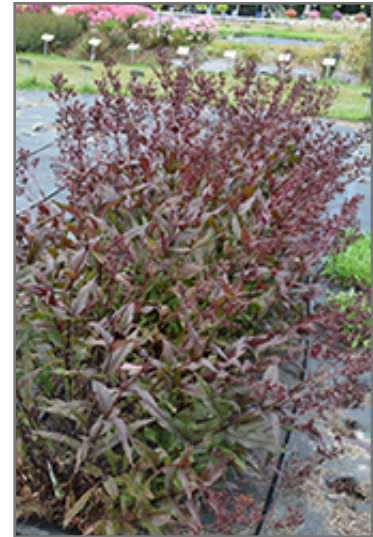
Pocahontas Beard Tongue

Pocahontas Beard Tongue is an herbaceous perennial with an upright spreading habit of growth. Its medium texture blends into the garden, but can always be balanced by a couple of finer or coarser plants for an effective composition.