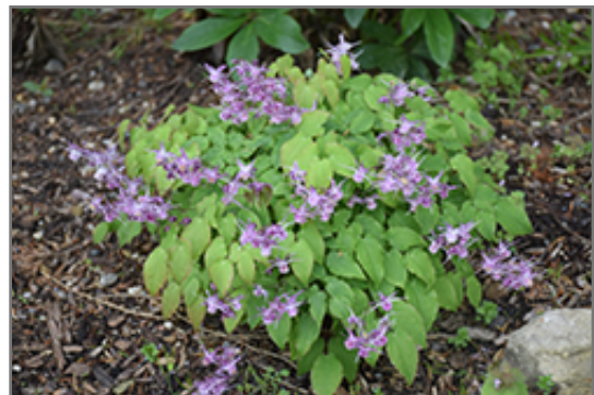
Purple Pixie Bishop's Hat in bloom