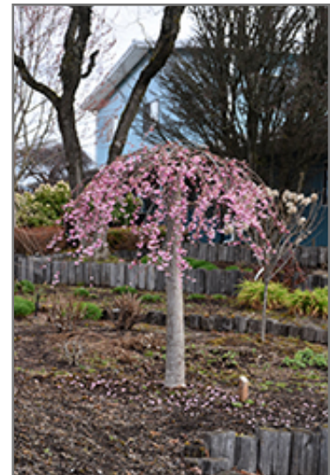
Pink Cascade Weeping Cherry in bloom