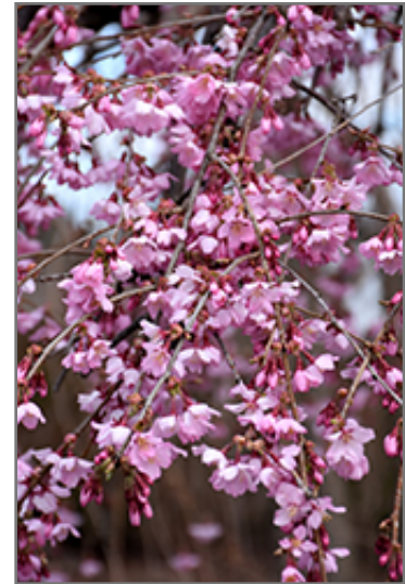
Pink Cascade Weeping Cherry flowers

Pink Cascade Weeping Cherry is recommended for the following landscape applications;