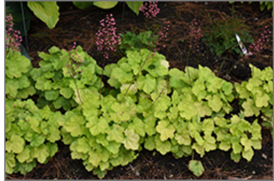
Primo Pretty Pistachio Coral Bells

Primo Pretty Pistachio Coral Bells is a fine choice for the garden, but it is also a good selection for planting in outdoor pots and containers. With its upright habit of growth, it is best suited for use as a 'thriller' in the 'spiller-thriller-filler' container combination; plant it near the center of the pot, surrounded by smaller plants and those that spill over the edges. Note that when growing plants in outdoor containers and baskets, they may require more frequent waterings than they would in the yard or garden.