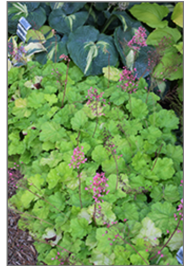
Primo Pretty Pistachio Coral Bells in bloom

This is a relatively low maintenance plant, and should be cut back in late fall in preparation for winter. It is a good choice for attracting butterflies and hummingbirds to your yard. It has no significant negative characteristics.