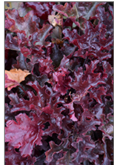
Dolce Cherry Truffles Coral Bells foliage