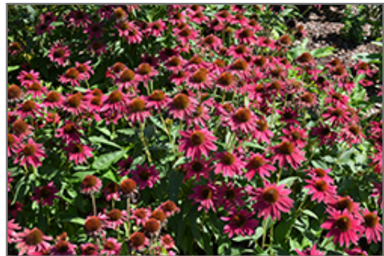
Sombrero Tres Amigos Coneflower in bloom