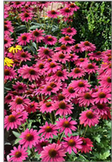
Sombrero Tres Amigos Coneflower flowers

Sombrero Tres Amigos Coneflower is a fine choice for the garden, but it is also a good selection for planting in outdoor pots and containers. With its upright habit of growth, it is best suited for use as a 'thriller' in the 'spiller-thriller-filler' container combination; plant it near the center of the pot, surrounded by smaller plants and those that spill over the edges. Note that when growing plants in outdoor containers and baskets, they may require more frequent waterings than they would in the yard or garden.