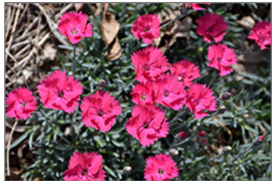
Paint The Town Magenta Pinks flowers