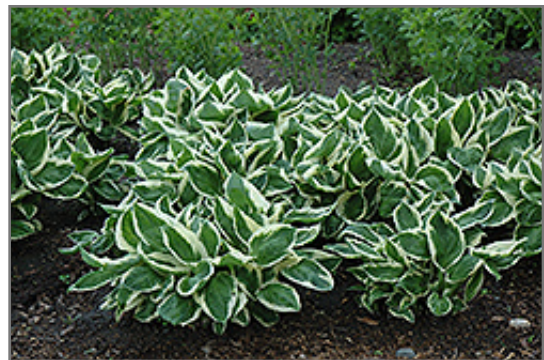
Minuteman Hosta