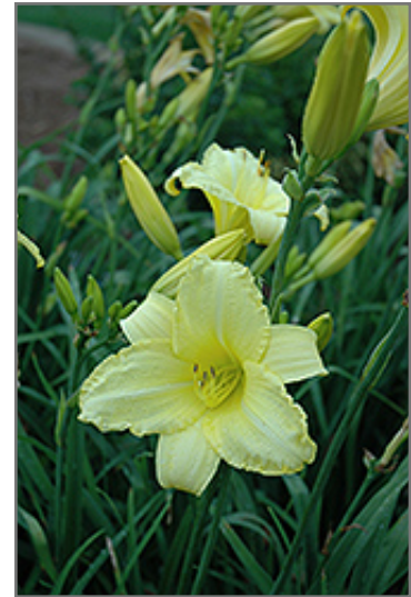
Happy Ever Appster Happy Returns Daylily flowers

Happy Ever Appster Happy Returns Daylily is recommended for the following landscape applications;